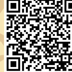
德語及文化學習團 OVERSEAS GERMAN STUDY PROGRAMME