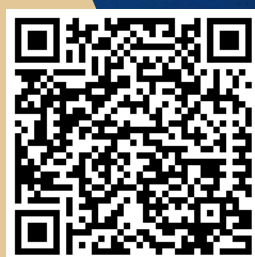
沙巴可持續發展研習團 SERVICE LEARNING IN SUSTAINABILITY IN SABAH