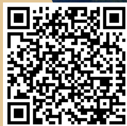
加拿大英語及文化學習團 ENGLISH STUDY PROGRAMME IN CANADA