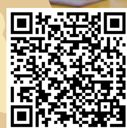
韓國身心療癒學習團 WELLNESS PROGRAMME IN KOREA

1. 每位同學只能申請最多兩個由書院舉辦的暑期計劃。 Each student can apply for a maximum of two College Summer Programmes.