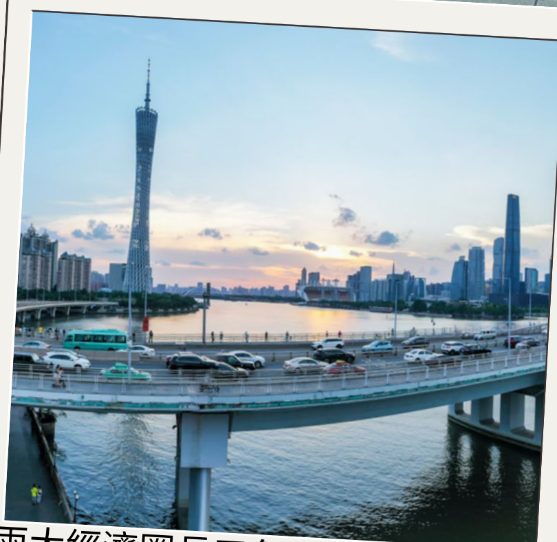
兩大經濟圈長三角/珠三角考察計劃 Study Programme in the Yangtze River Delta and the Pearl River Delta