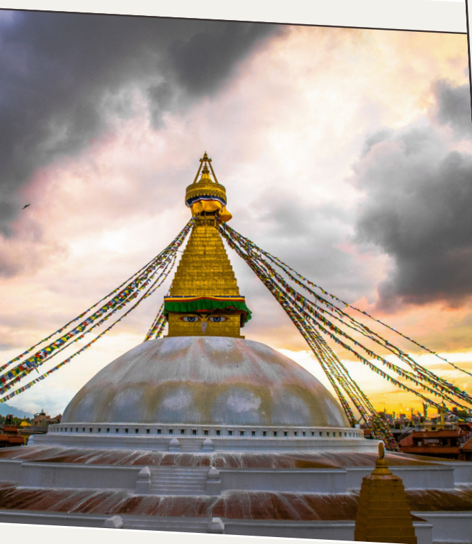
尼泊爾禪修之旅 Mindfulness Retreat in Nepal