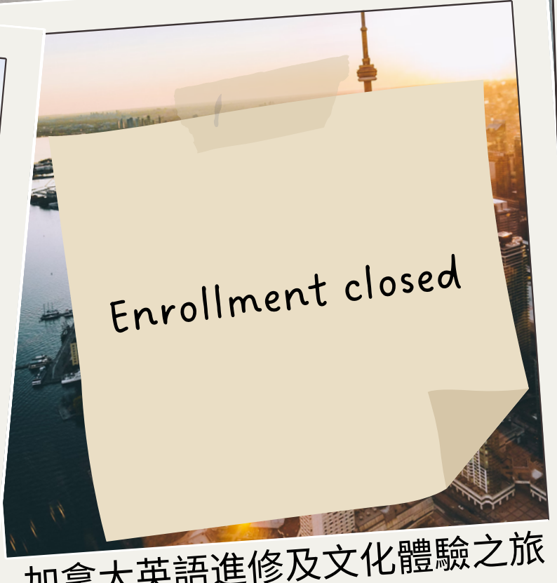
加拿大英語進修及文化體驗之旅 Summer English Enhancement and Cultural Experience in Canada