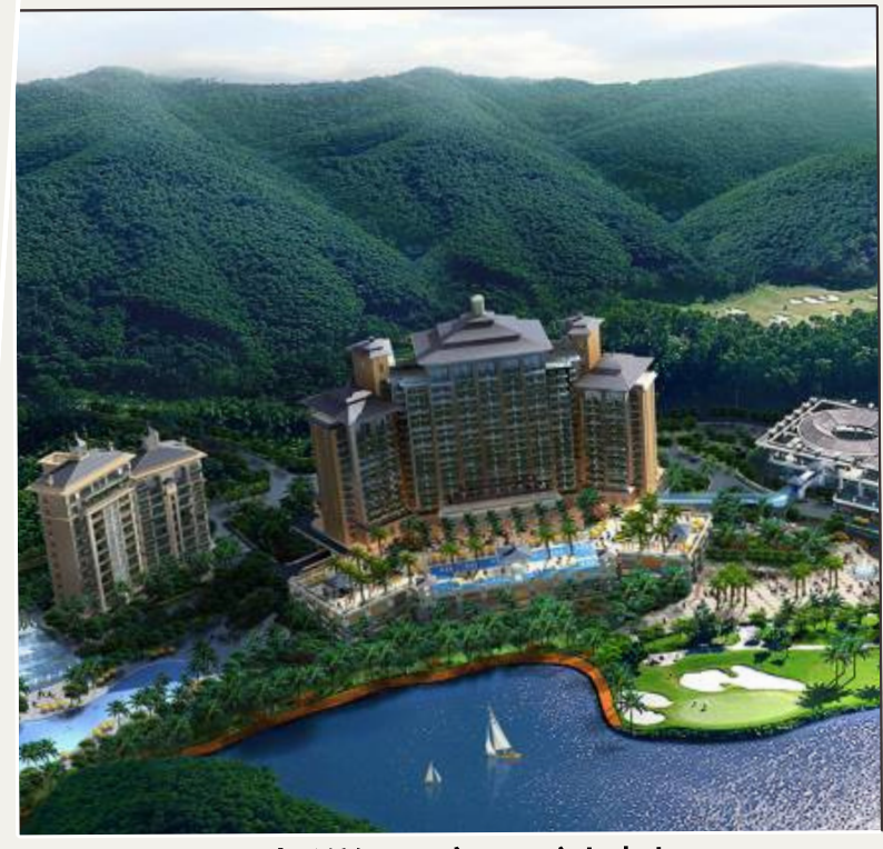
大灣區實習計劃 Internship Programme in Greater Bay Area