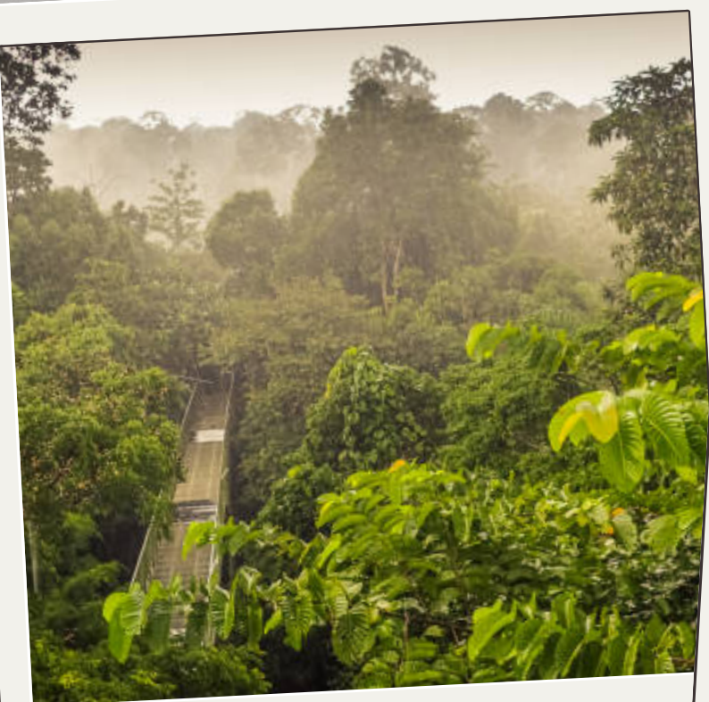
馬來西亞熱帶雨林之旅 Green Trip to Borneo Rainforest