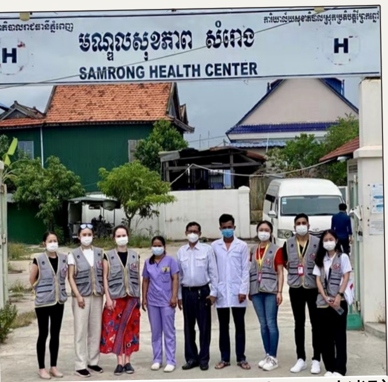
服務學習計劃 (塞內加爾/老撾) Service Learning Programme (Senegal/ Laos)