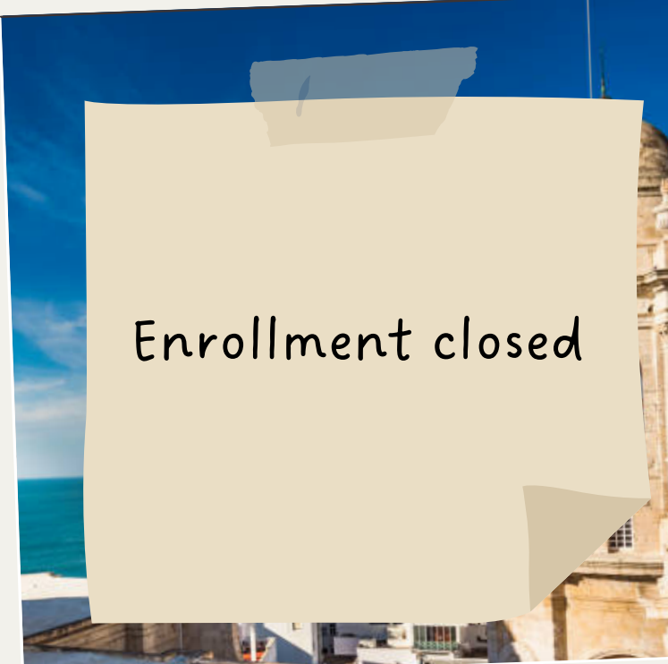
西班牙語及文化學習團 Spanish Study Programme